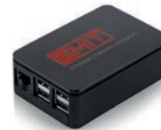
RelayCaster One (For illustration only)